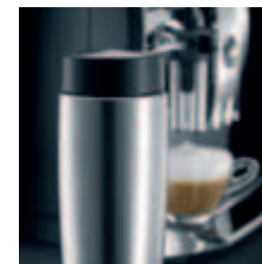
Stainless steel milk container